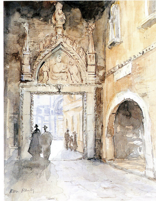
Ann Manly Approaching Campo San Zaccaria Venice 10x7 1/2"