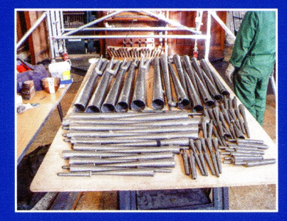
Table of small pipes, partly taken apart