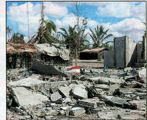
The devastation left after Cyclone Idai.