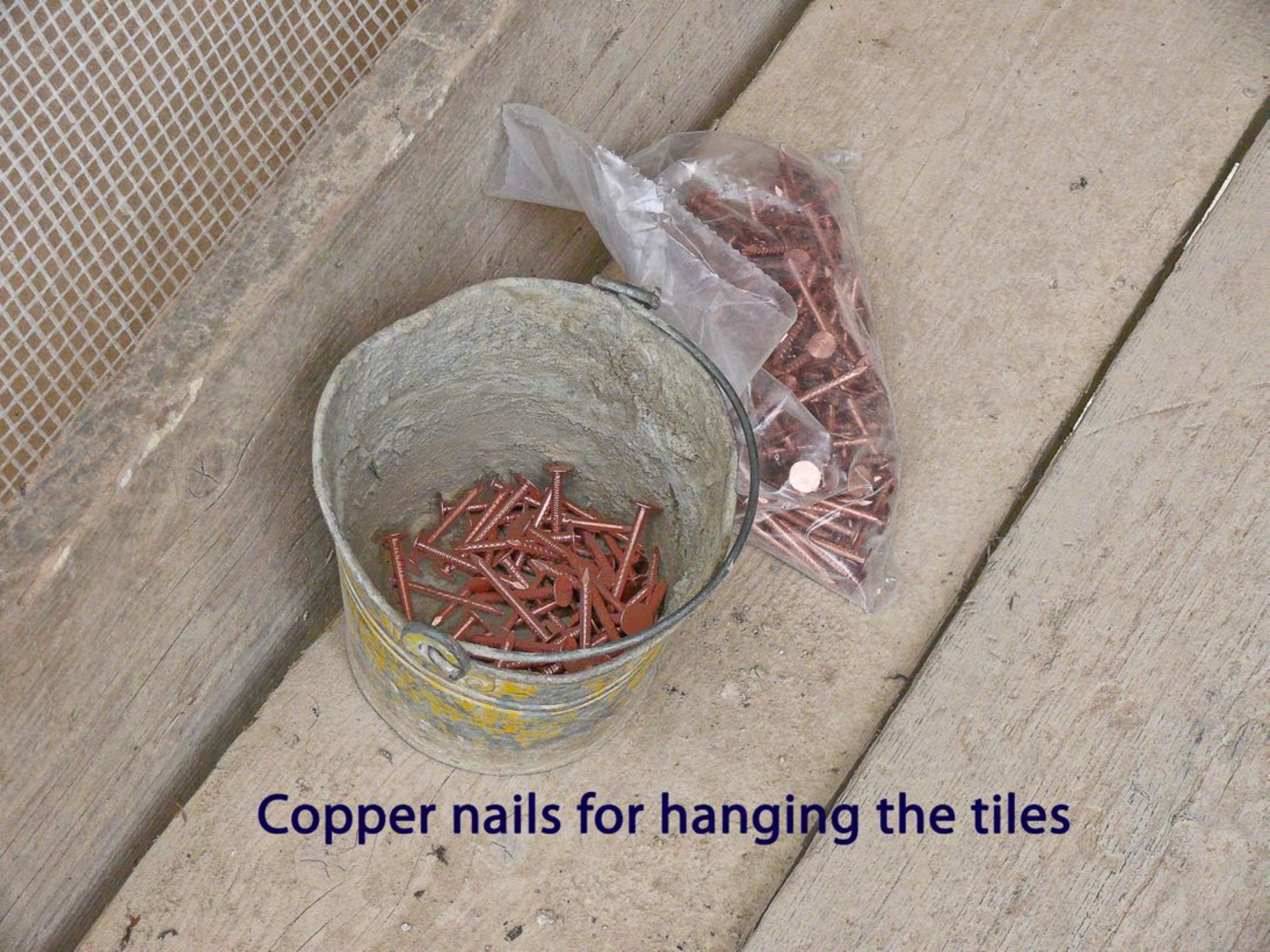
Copper nails for hanging the tiles