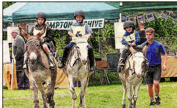
ON YOUR MARKS: Some very young jockeys get taken to the start line for the big race