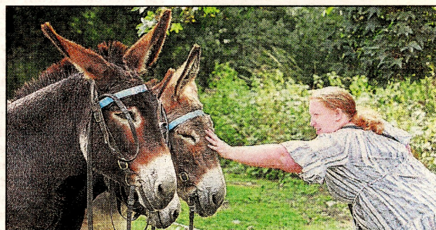
FRIENDLY FACE: The donkeys came from Weston-super-Mare