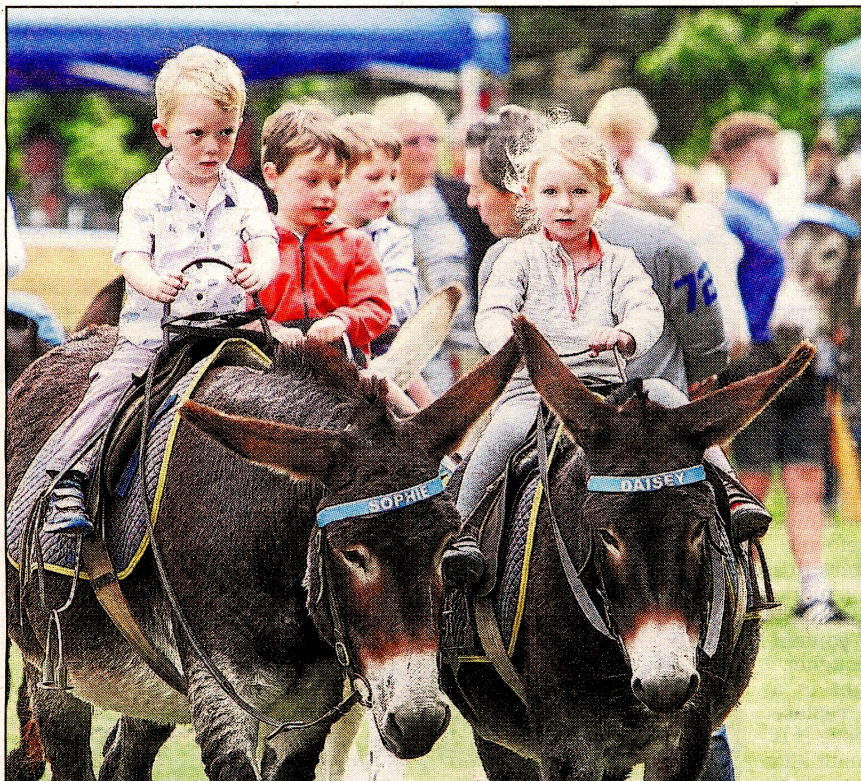
IN THE SADDLE: These children were unconvinced about their noble steeds