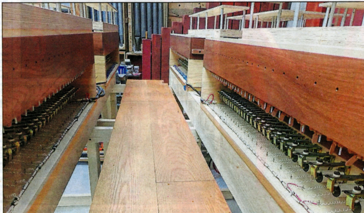
THE organ's soundboard under construction at Cousans.

He said: "We've done all sorts of funding campaigns including regular quiz nights and 12-hour sponsored organ playing sessions with