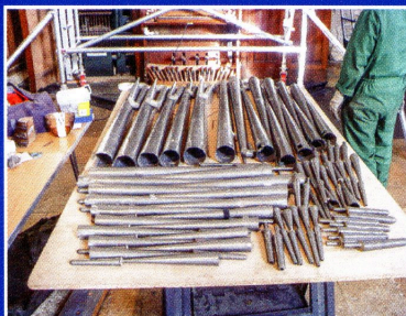
Table of small pipes, partly taken apart