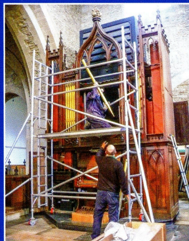
Another large pipe coming out