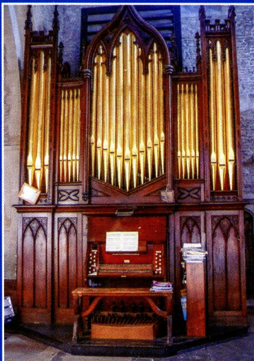
The organ before dismantling