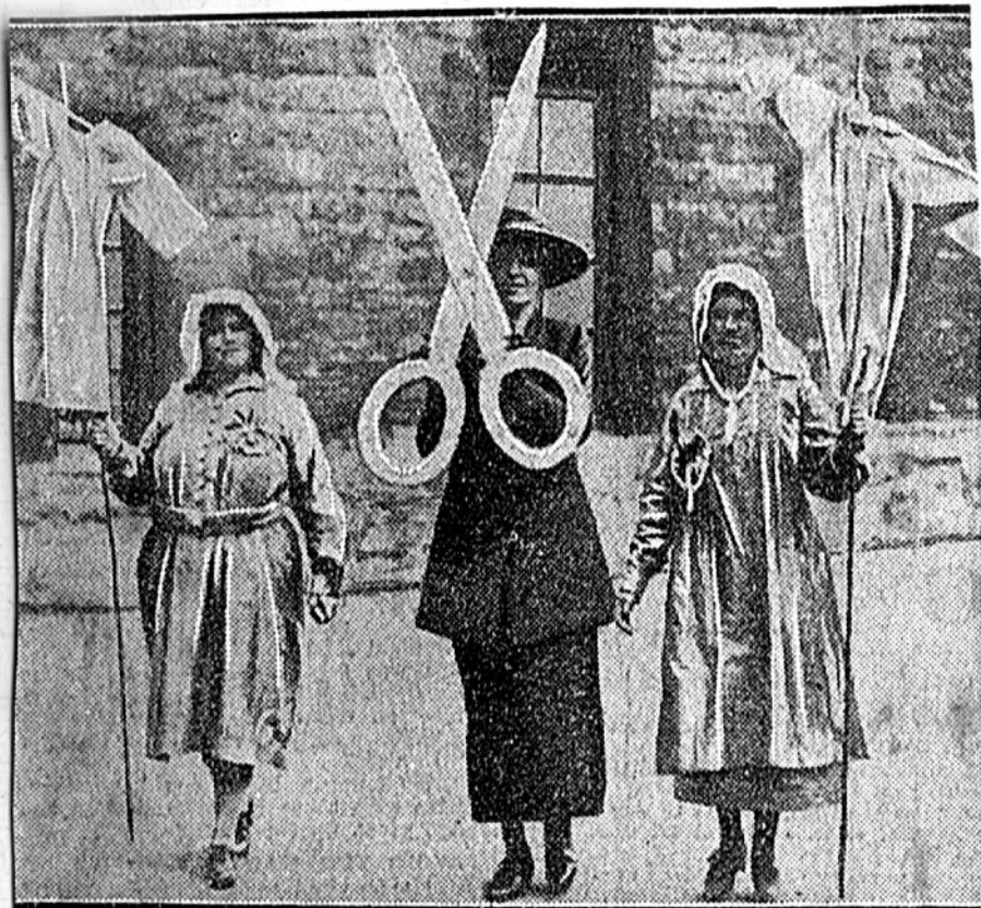
THE SYMBOLS OF THEIR CRAFT being carried by smock-makers of Bampton at an Oxford rally of Women's Institutes attended by representatives of various village industries in the county.