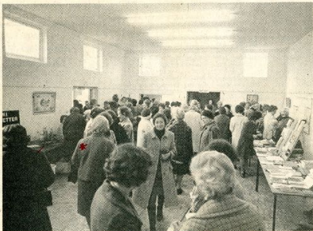
A general view of the lofty and well-lit main hall of the new WI headquarters at Summertown.

Women's Institute members from all over Oxfordshire had a chance on Wednesday to see their new county headquarters in Middle Way, Summertown. In the second of two open days, 800 women visited the building, on which renovation work finished only last week.