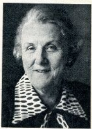
says this week's guest

In the Institute we are also concerned about the population explosion—it's a frightening thought. Did you know that England and Wales are second only to Formosa for density of population? Not only must this put a