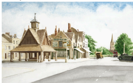
A 1930s GWR coach on Witney High Street to Cheltenham