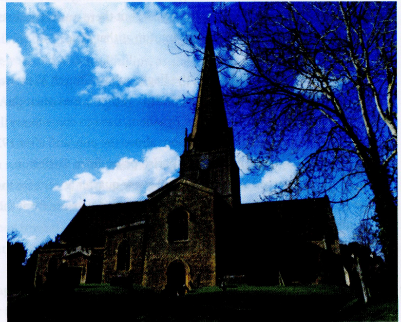
St Mary's Church, Bampton