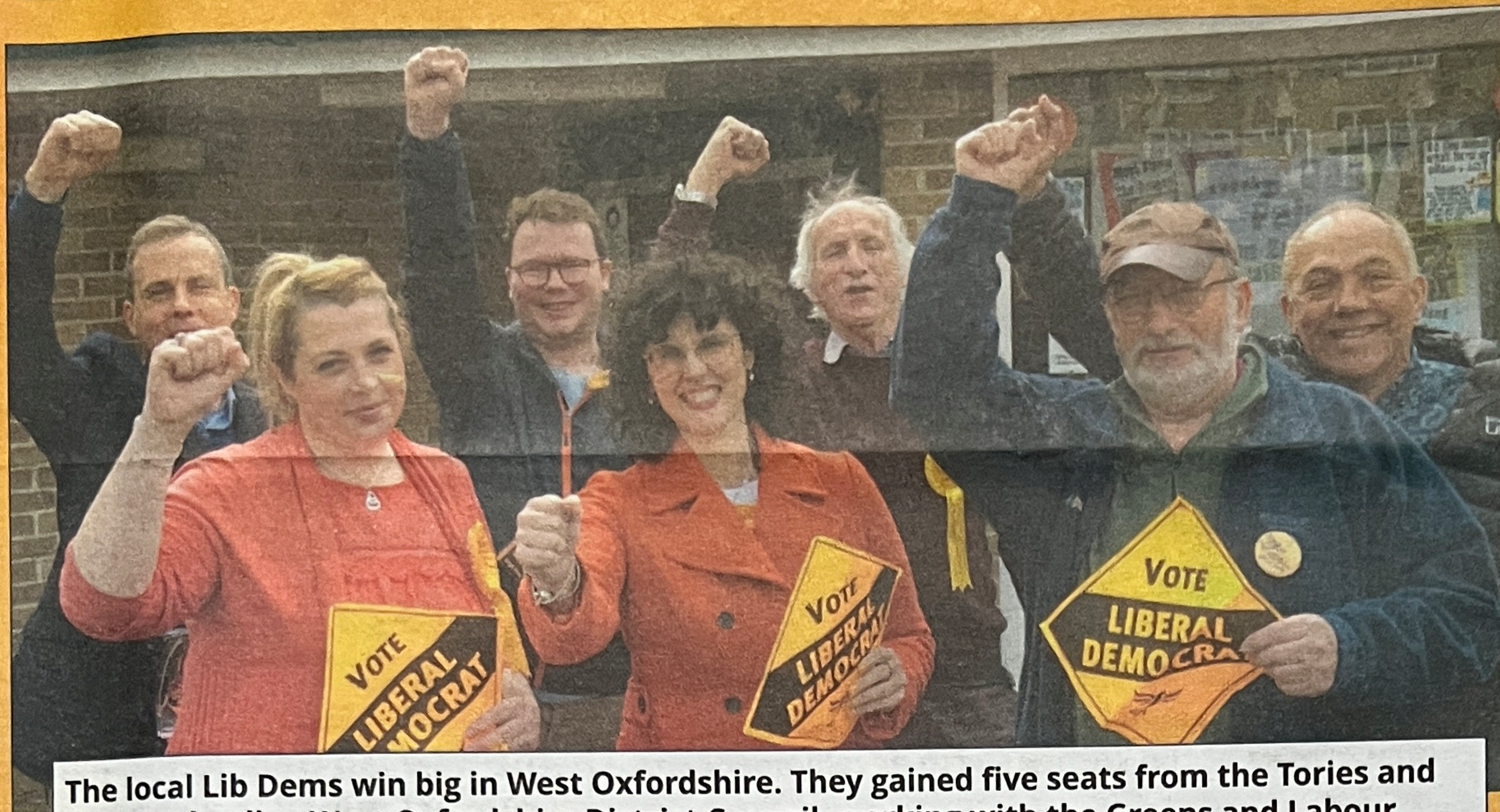
The local Lib Dems win big in West Oxfordshire. They gained five seats from the Tories and are now leading West Oxfordshire District Council, working with the Greens and Labour.

The Lib Dems were the big winners across the county in the local elections in May, gaining ten seats from the Conservatives.