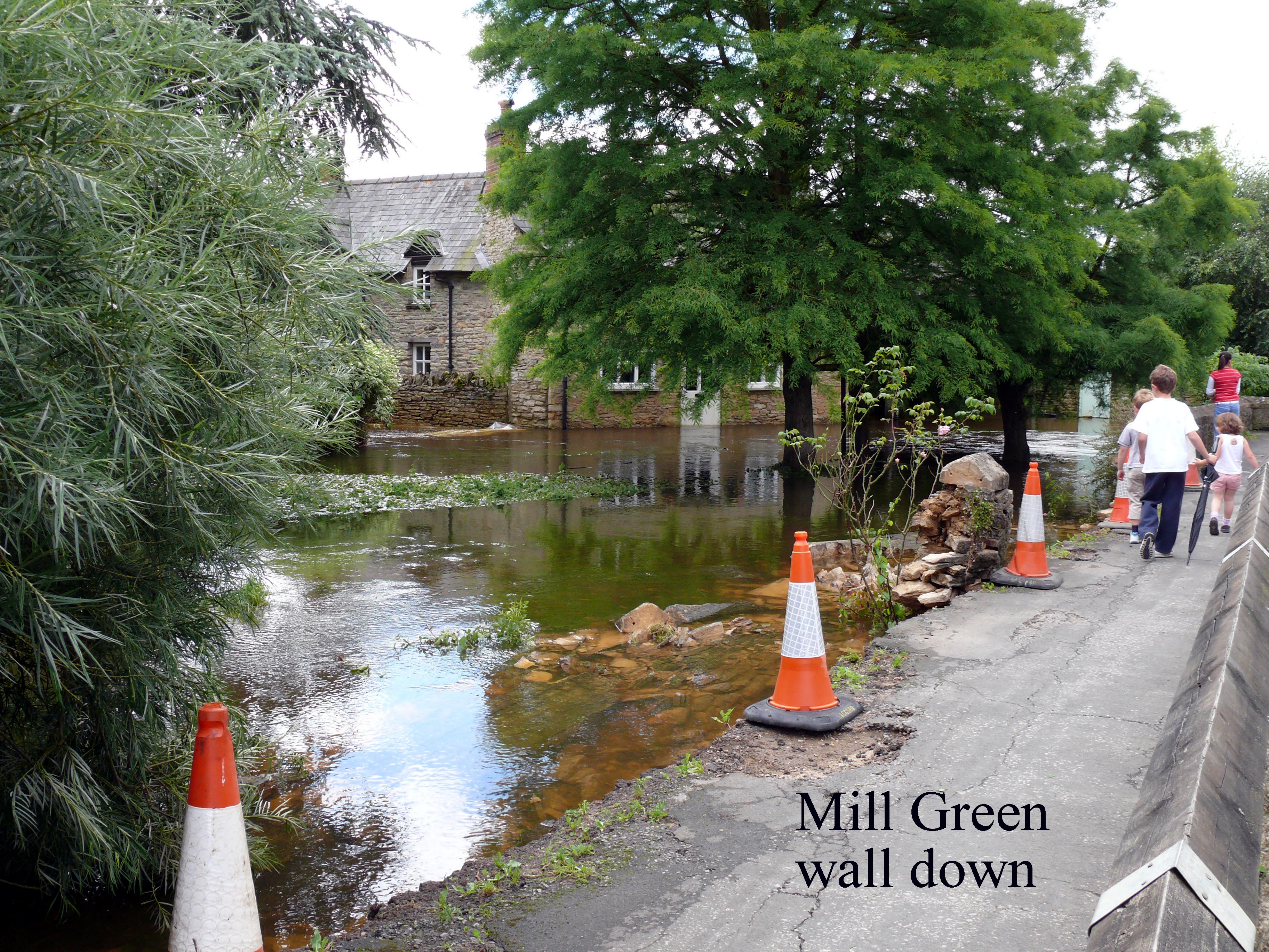
Mill Green wall down