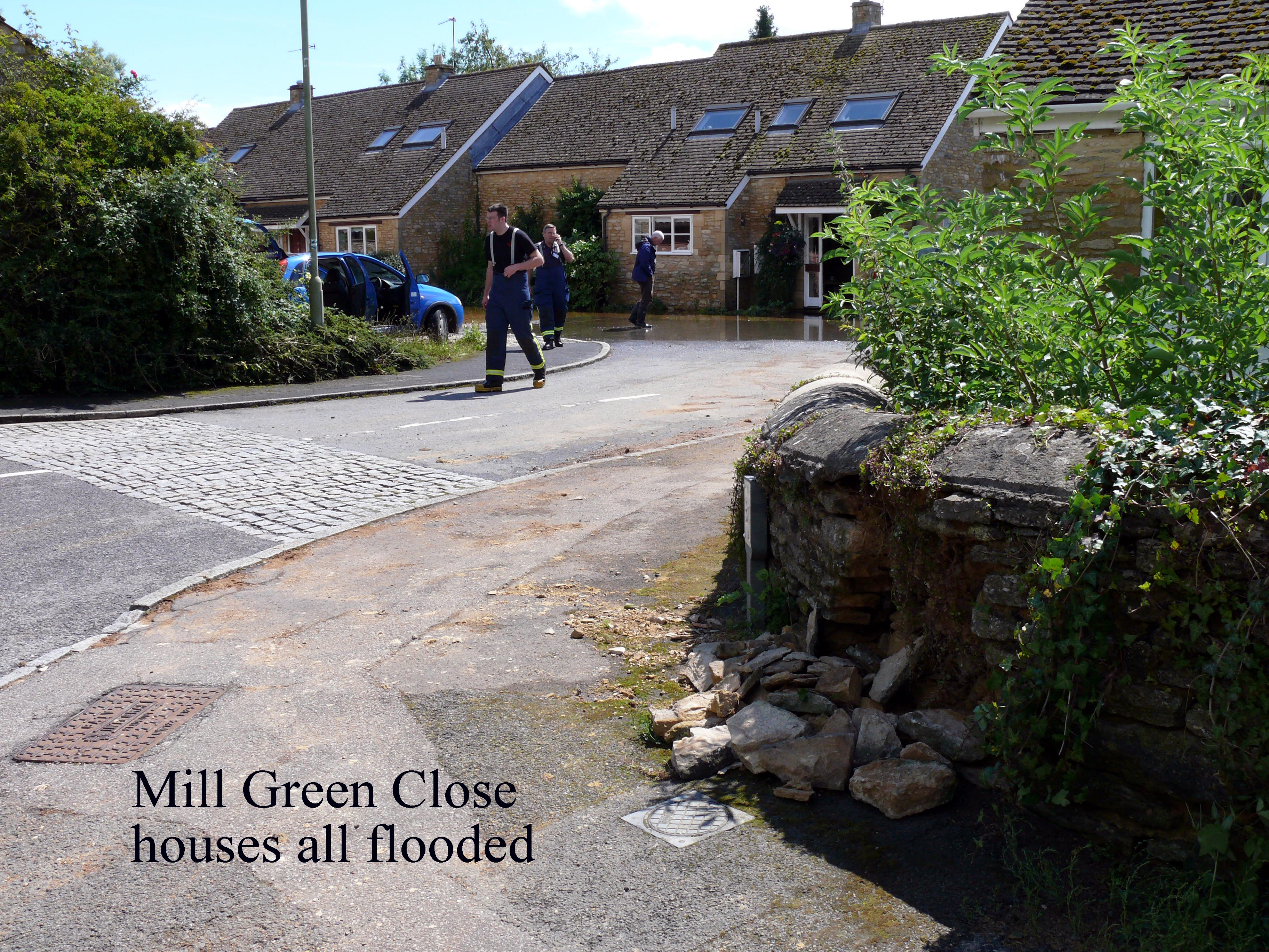
Mill Green Close houses all flooded