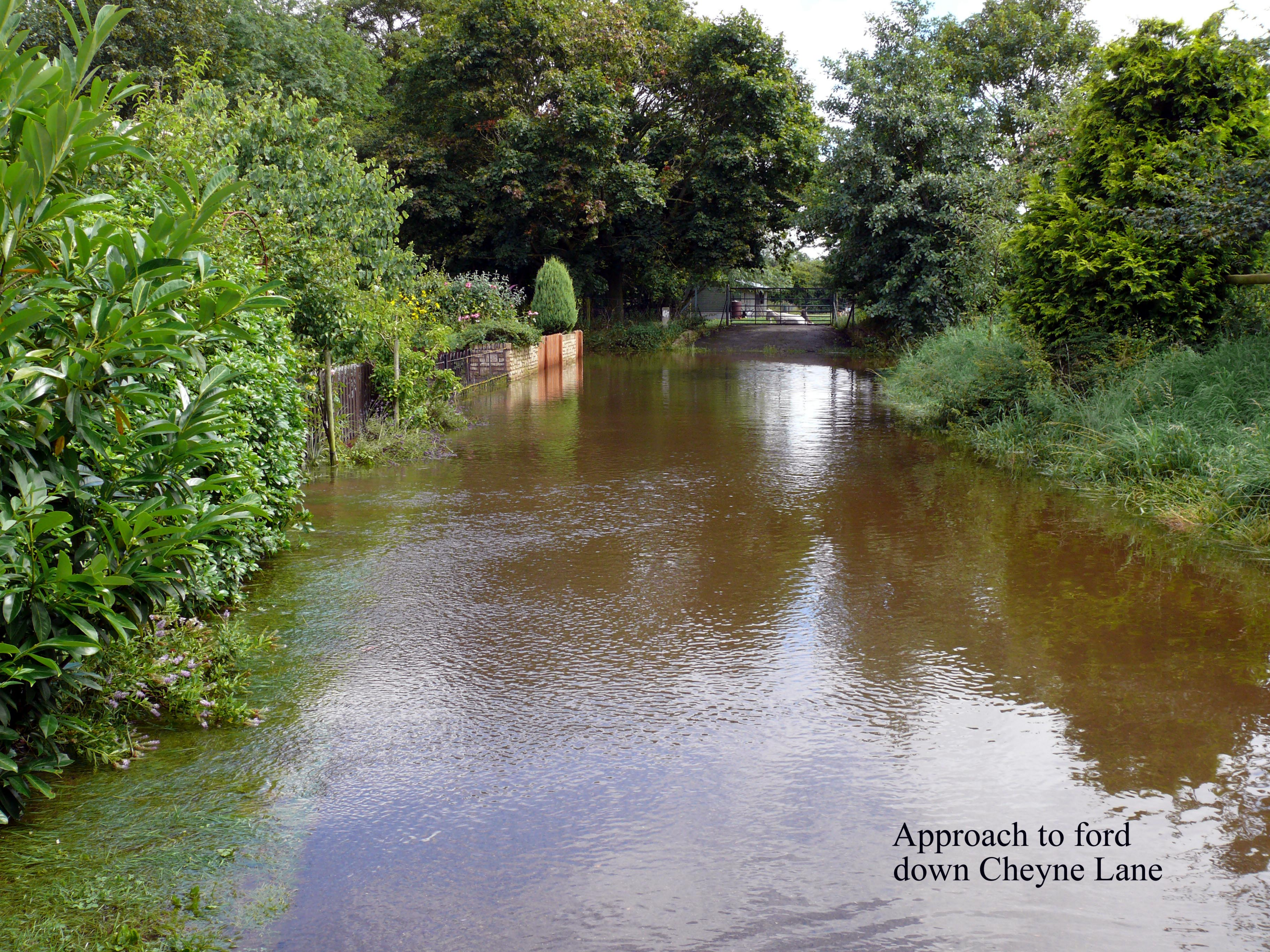
Approach to ford down Cheyne Lane