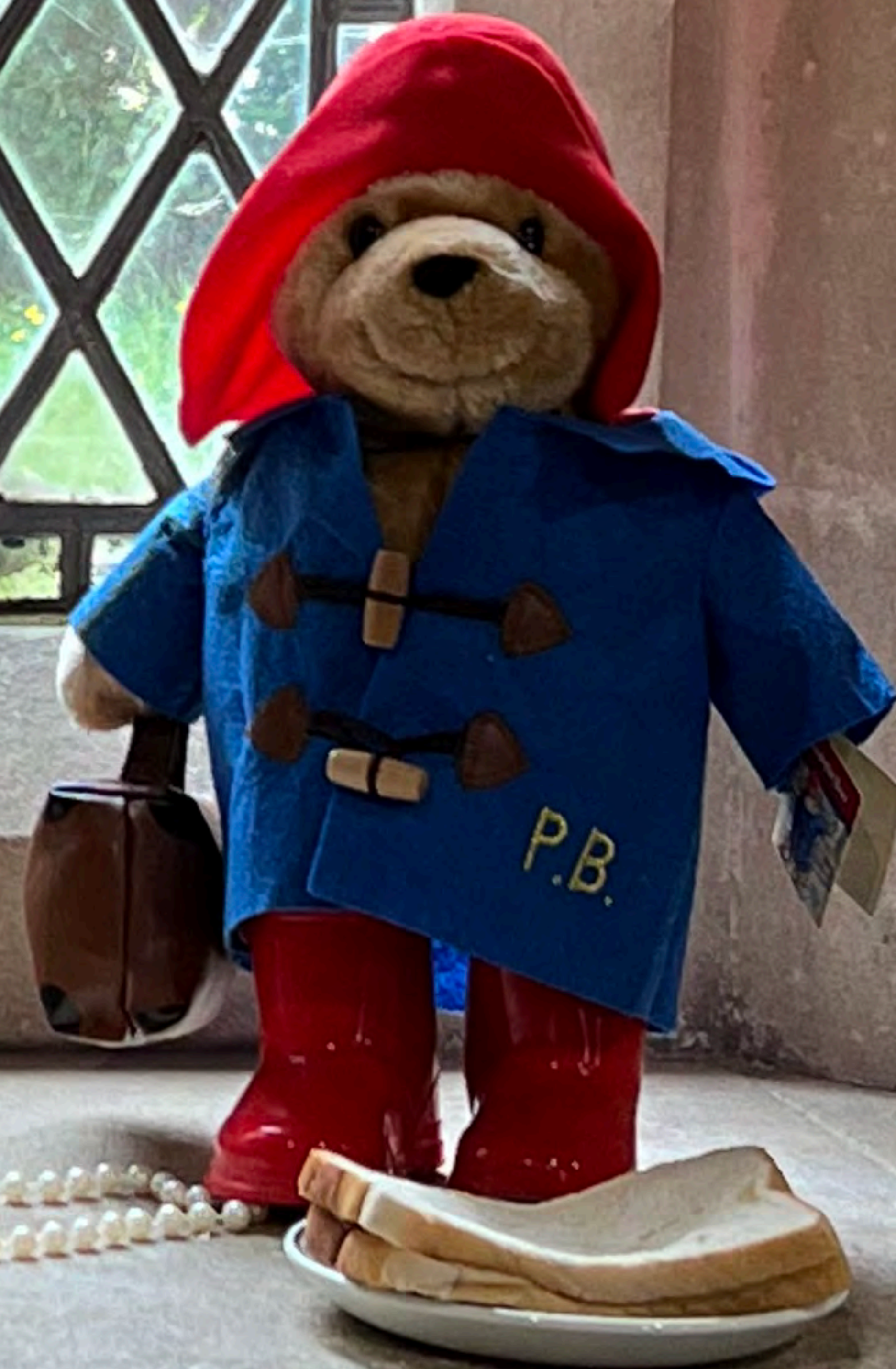
The Queen Mary Buckingham