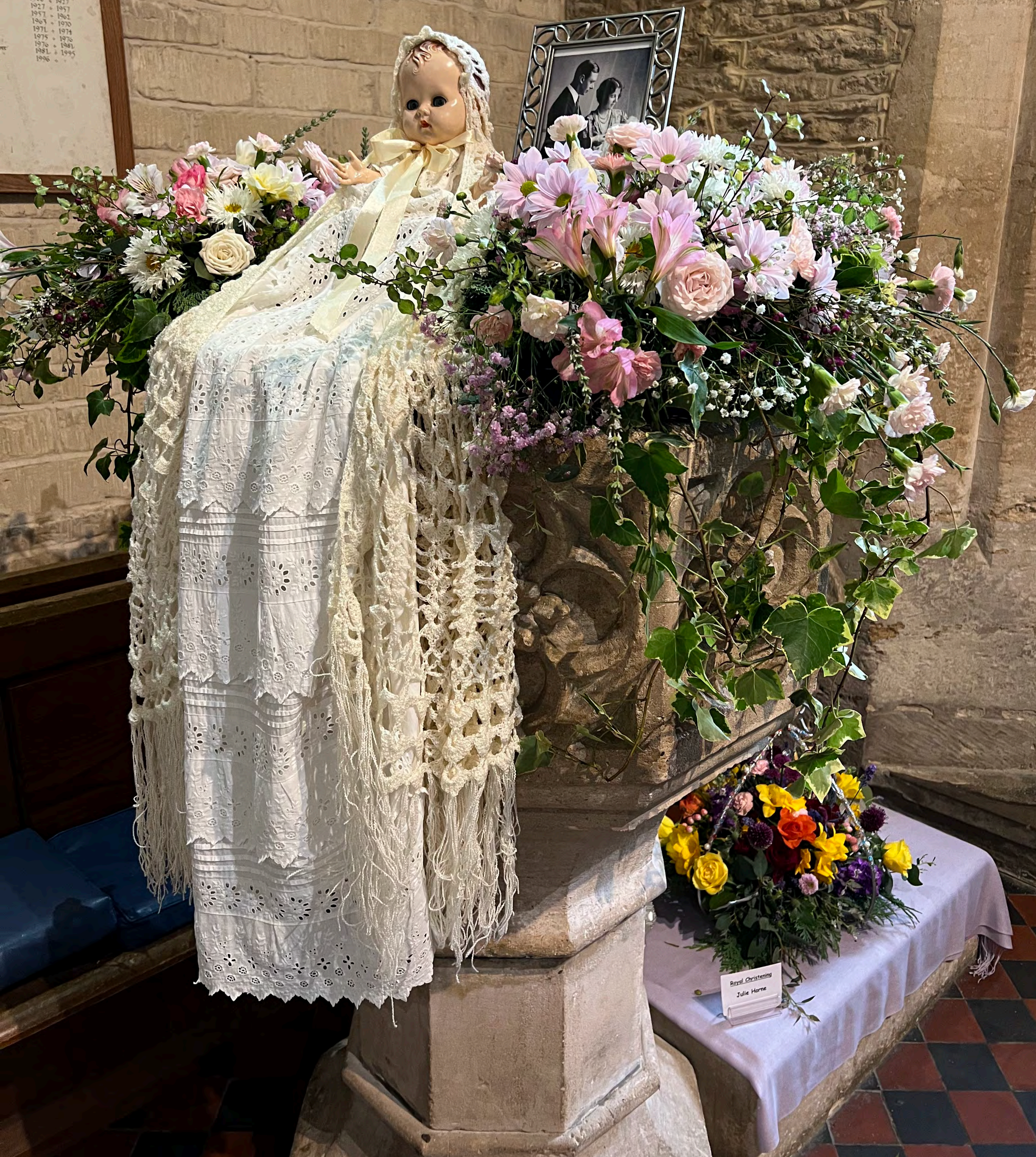
Royal Christening Julie Horne

1476 1480 1511 1519 1548 1558 1566 1577 1587 1600 1614 1620 1644 1662 1671 1730 1782 1782 1793 1800 1823 1823 1836 1864 1873 1876 1903 1905 1908 1927 1957 1963 1971 1975 1976 1981 1981 1995 1996