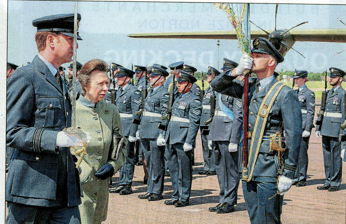
Princess Anne marks the end of the Hercules and the 47 Squadron at Brize Norton.

Unable to access Khartoum airport, which 47 Squadron established in 1927, Hercules evacuated over 2,000 Embassy staff and British passport holders from a degrading