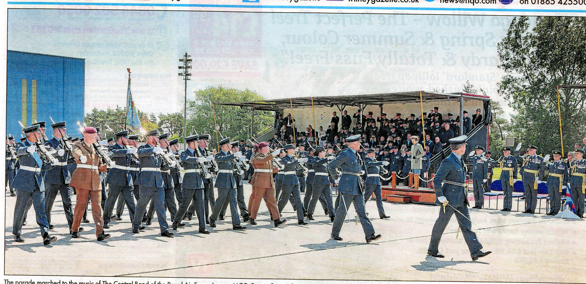
The parade marched to the music of The Central Band of the Royal Air Force.