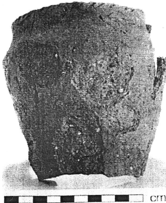
Pot recovered from Iron Age pit (8th-6th centuries BC)

work of boundary ditches were dug across the site, probably marking out properties that were set up along what is now Church View. This was when the original market place was probably at the north end of Church View, right outside the minster gate. However, in the 14 th century Bampton declined; the market was moved to its present position, and it looks like the people and the buildings followed. Our site became waste ground and a big quarry pit was dug, presumably to extract gravel for new buildings.