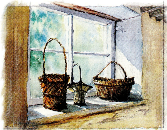
Ann Manly Old Baskets (detail) 8x10"

They have exhibited in mixed shows in London, including exhibitions at the Royal Watercolour Society, the Mall Galleries and the "Venice in Peril" Exhibition.