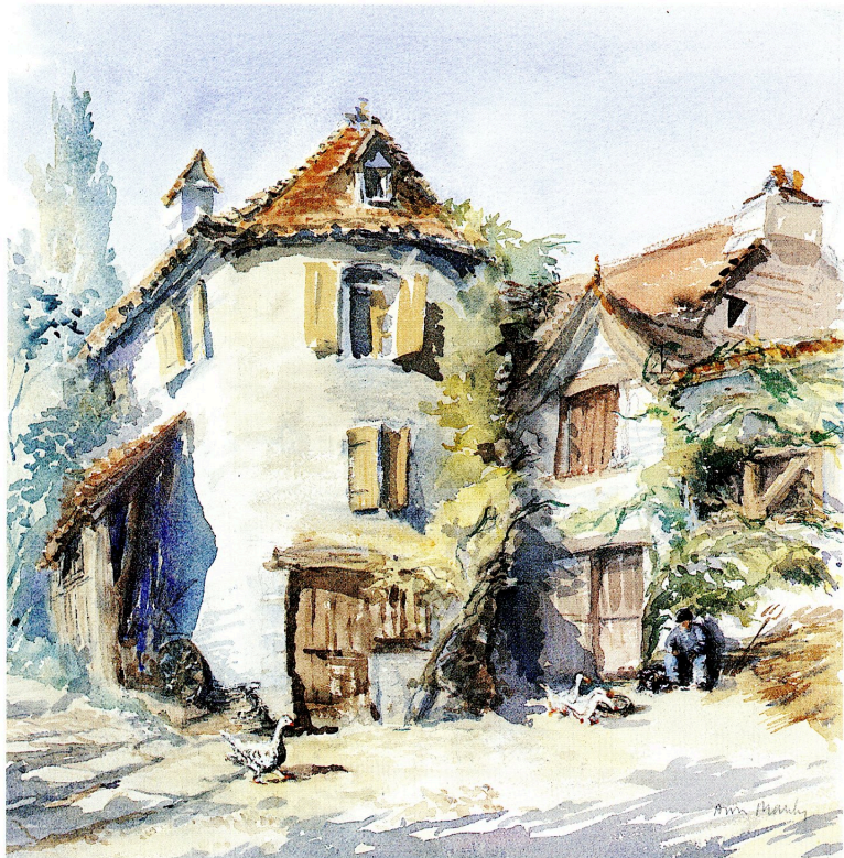
Ann Manly At Gaillac Lot Valley France 15x14 1/2"