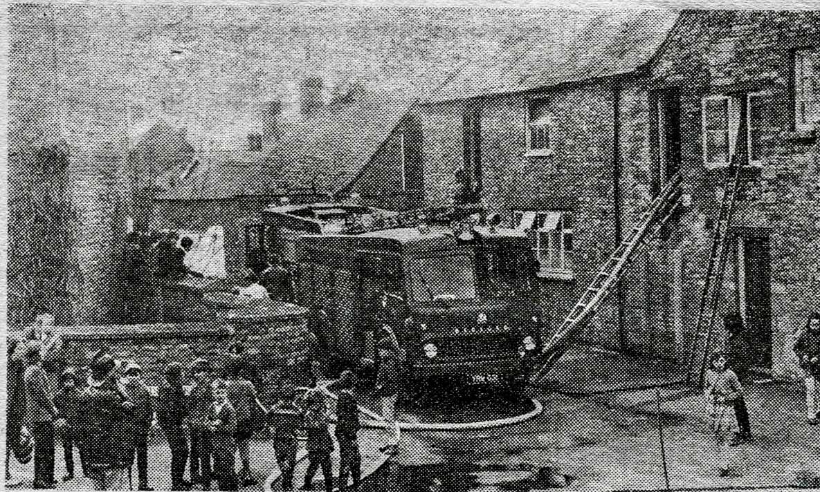
Fire engines at the Bakery, Bampton, on Wednesday.