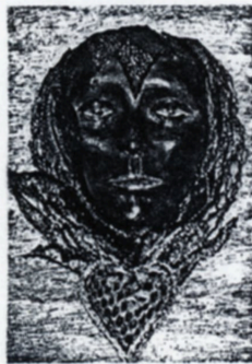
Madonna, porcelain and fabric figure by Rosa Davies