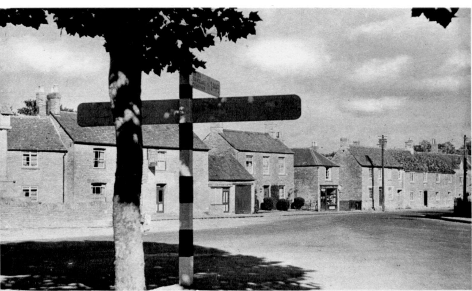
In the Square, Bampton