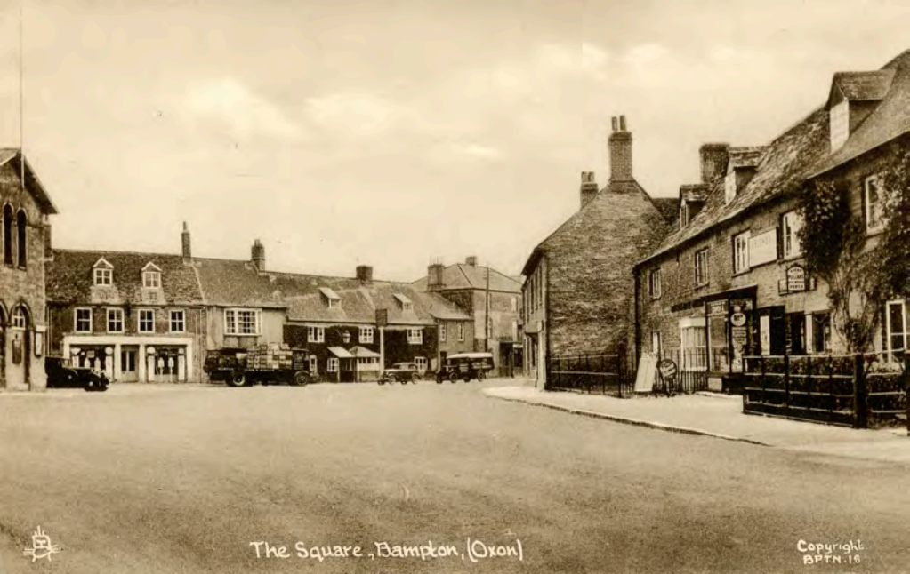
The Square, Bampton, (Oxon)