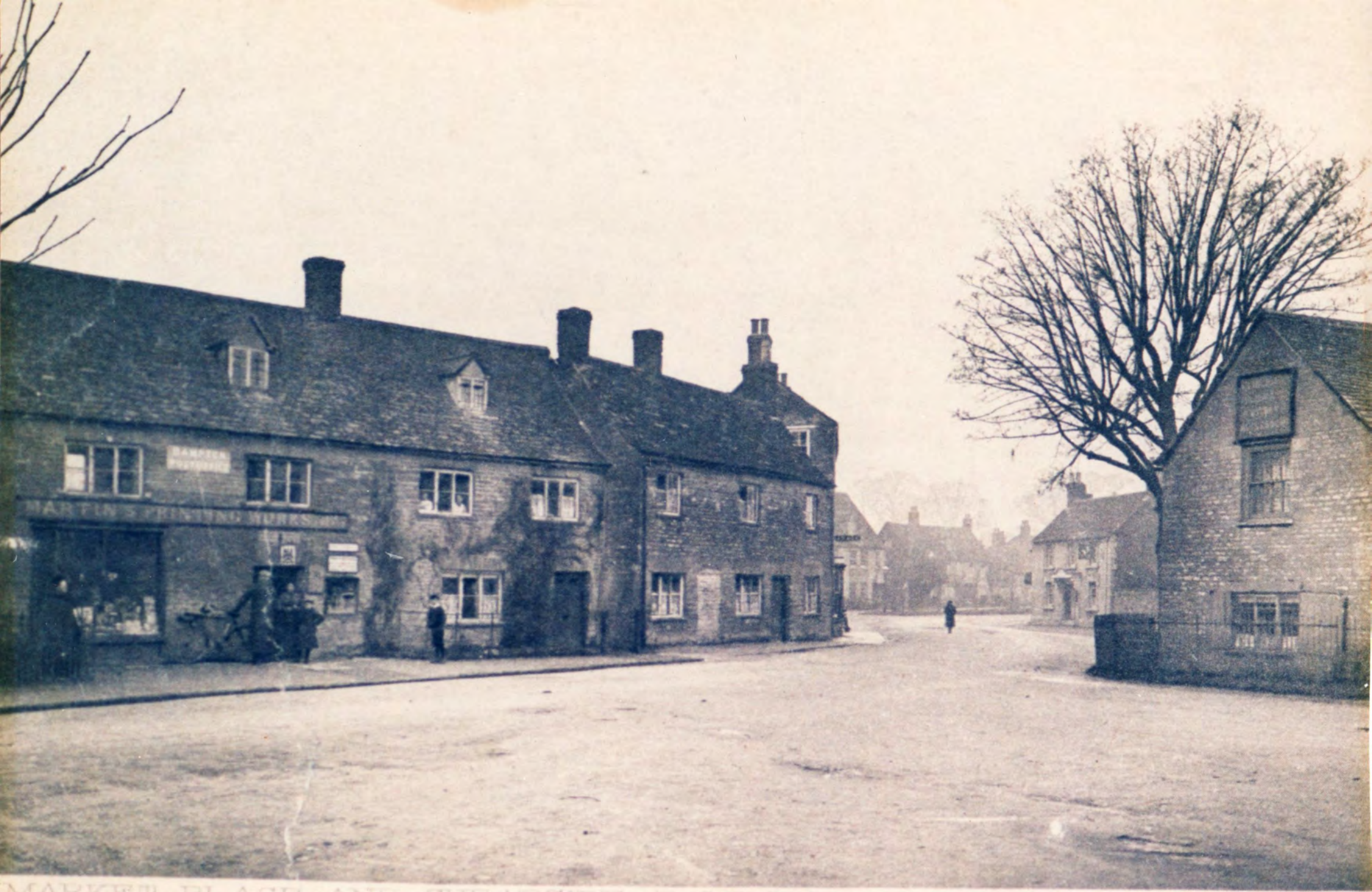
MARKET PLACE AND CHEAPSIDE, BAMPTON, OXON