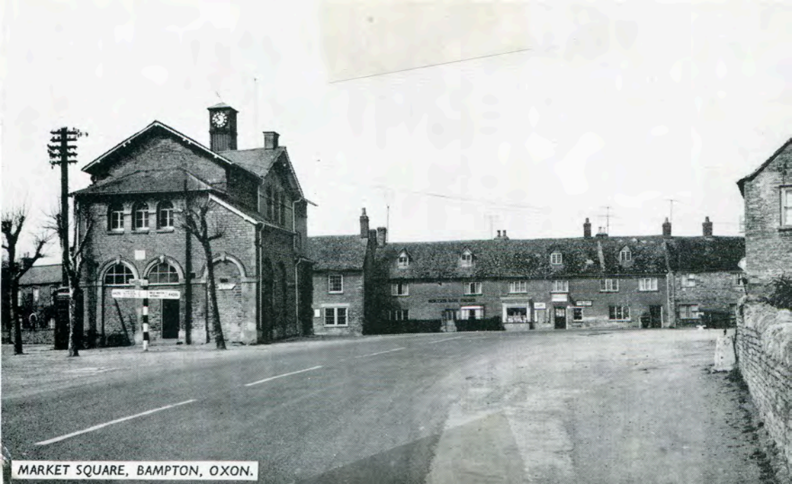
MARKET SQUARE, BAMPTON, OXON.