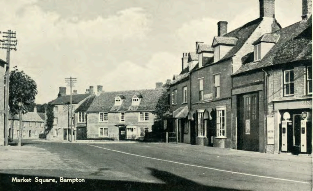
Market Square, Bampton