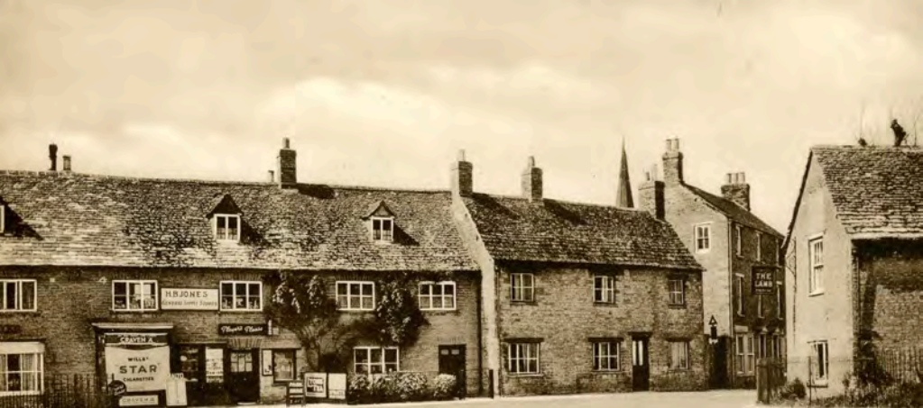
The Square, Bampton, (Oxon)