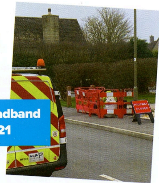
New superfast broadband installed March 2021

The pandemic has been a difficult time for all of us and it is going to take a while to get over it. Green shoots of recovery are beginning to sprout and I will be working hard to make sure that new infrastructure makes Oxfordshire better prepared to face the future.