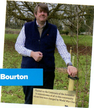
New Trees in Black Bourton

Without doubt, climate change is the biggest challenge facing the world at the moment. We will become a carbon neutral council by 2030. I am proud to have seconded a motion at Oxfordshire County Council calling for an increase in tree planting and to have been able to support tree planting in the division.