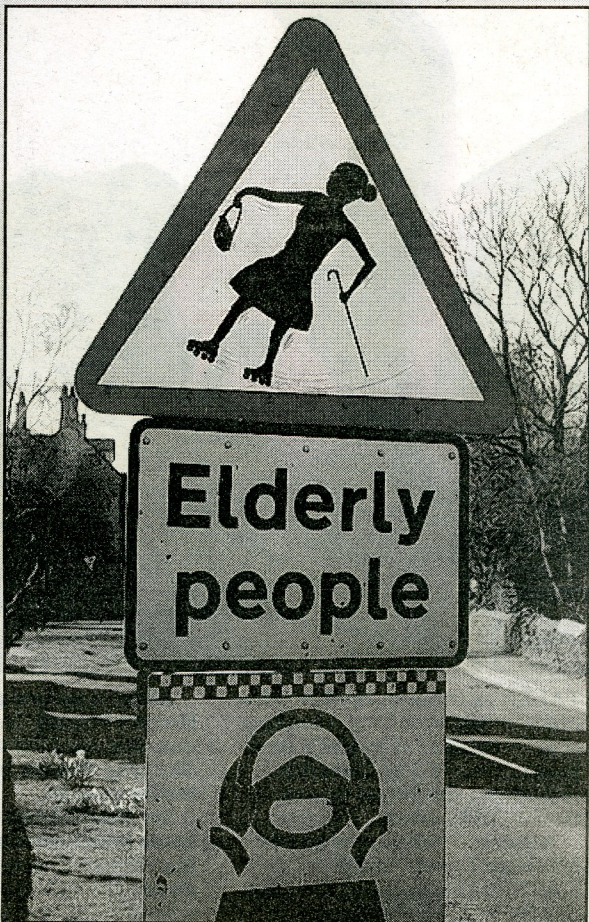
April change . . . the traditional sign (left), and this year's innovation (right)