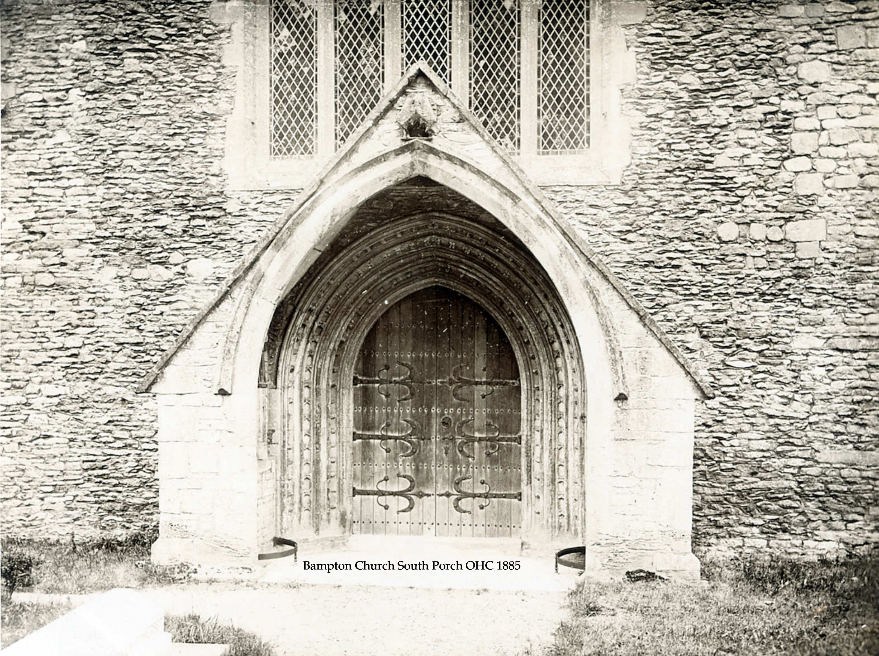
Bampton Church South Porch OHC 1885