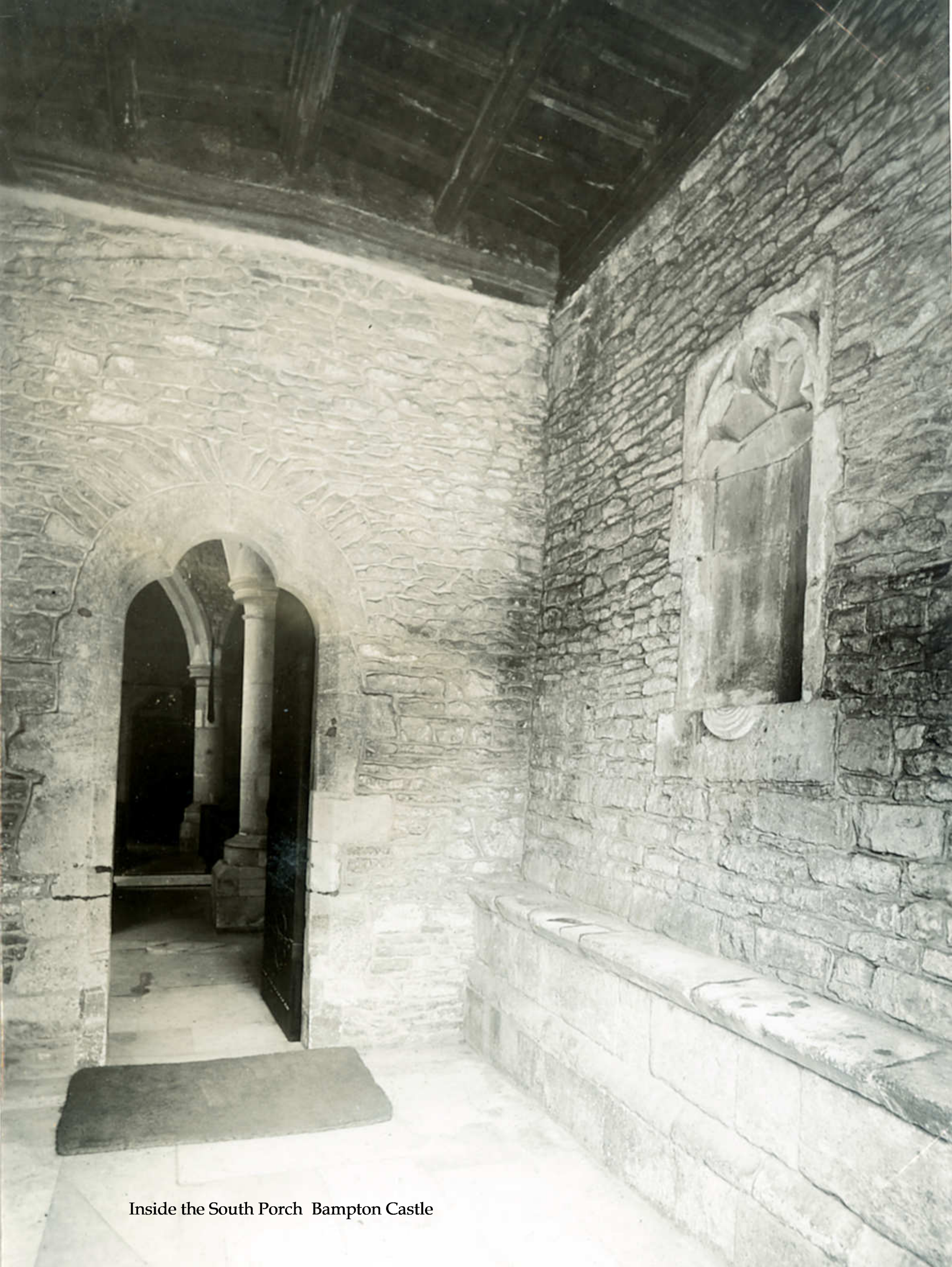
Inside the South Porch Bampton Castle