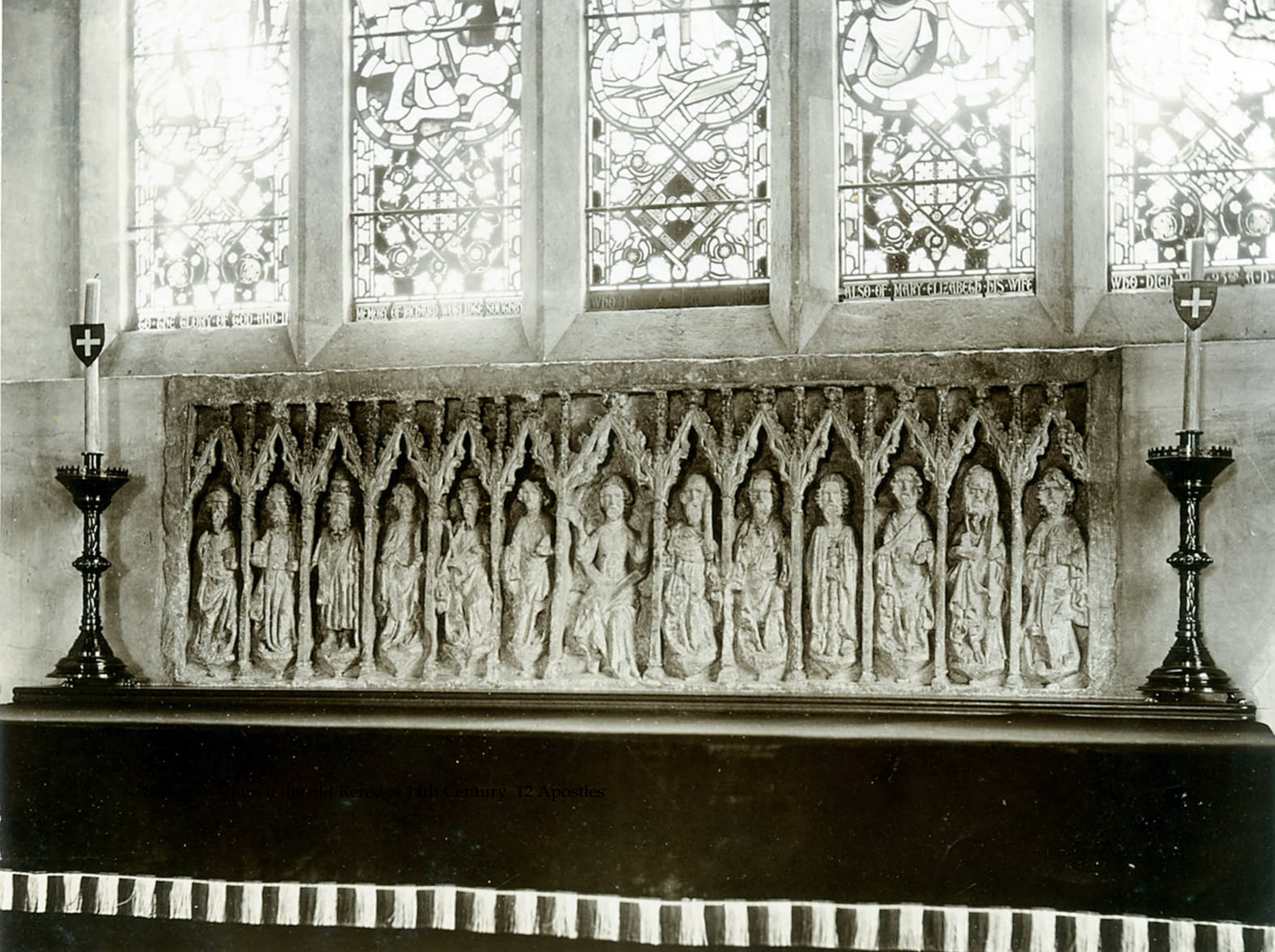
St. Mary's Church the old Reredos 14th Century 12 Apostles