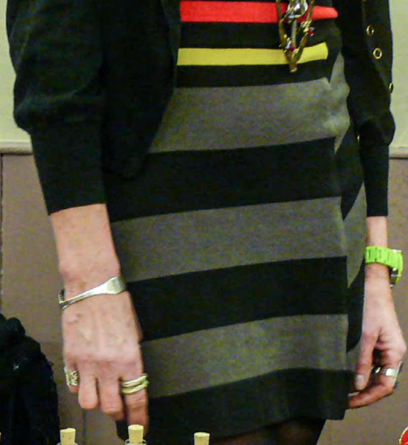
Fig chutney £5.50 With Cranberries