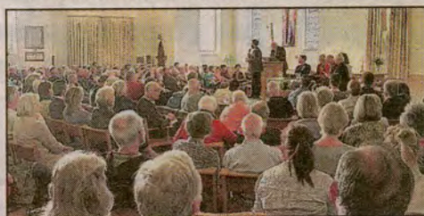
CROWD: Some of the voters packed into the general election hustings in Witney

People in the Witney constituency and across the country will take to polling stations on Thursday, June 8.