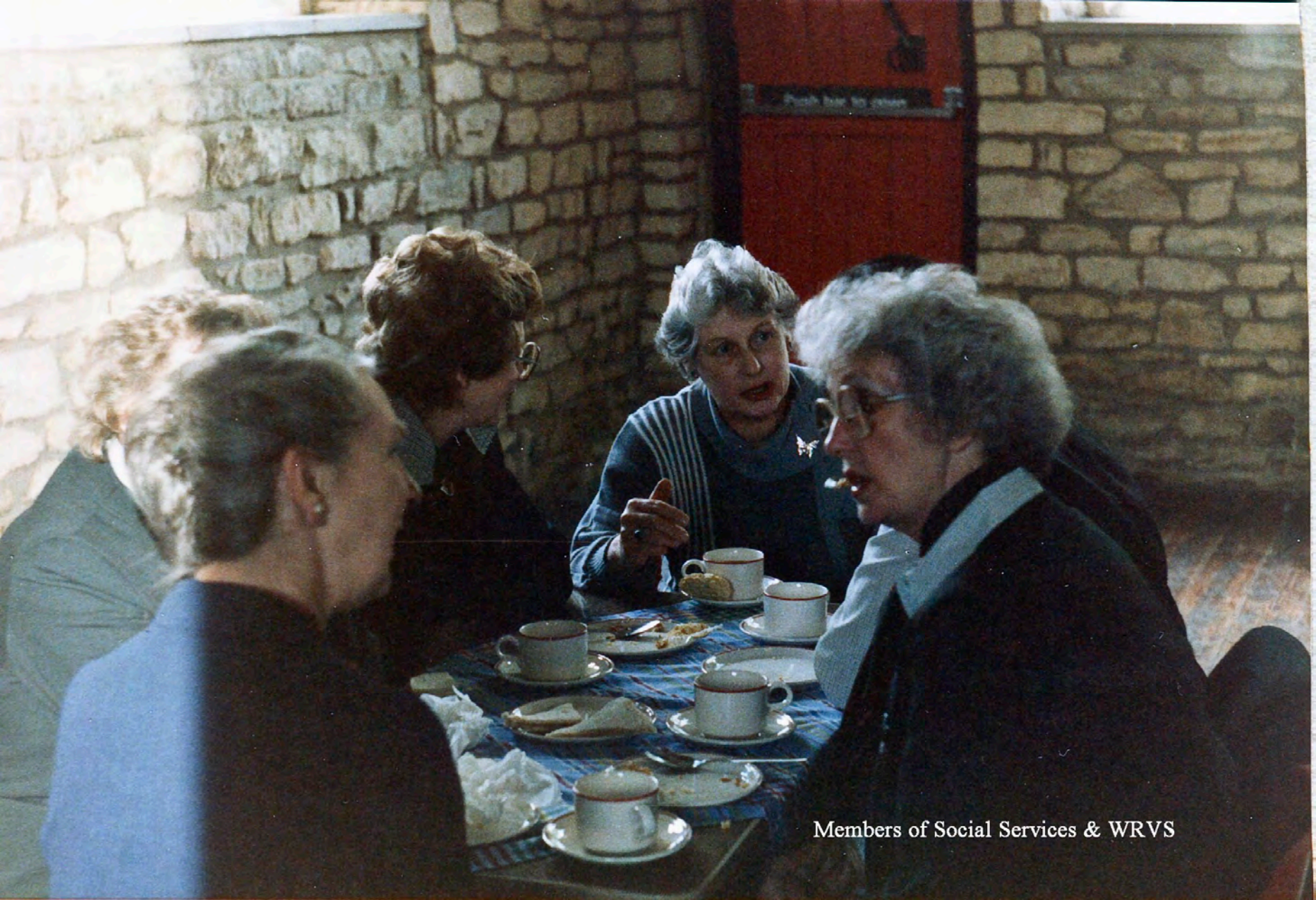
Members of Social Services & WRVS