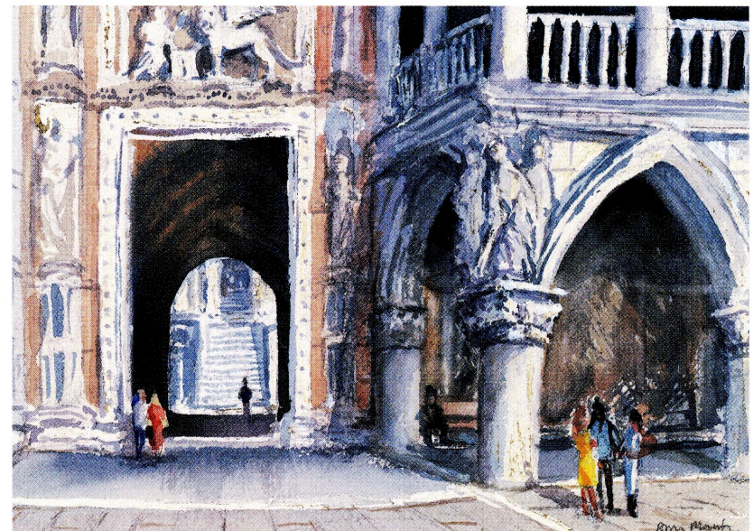
Ann Manly Porta della Carta, Venice 11" x 14"