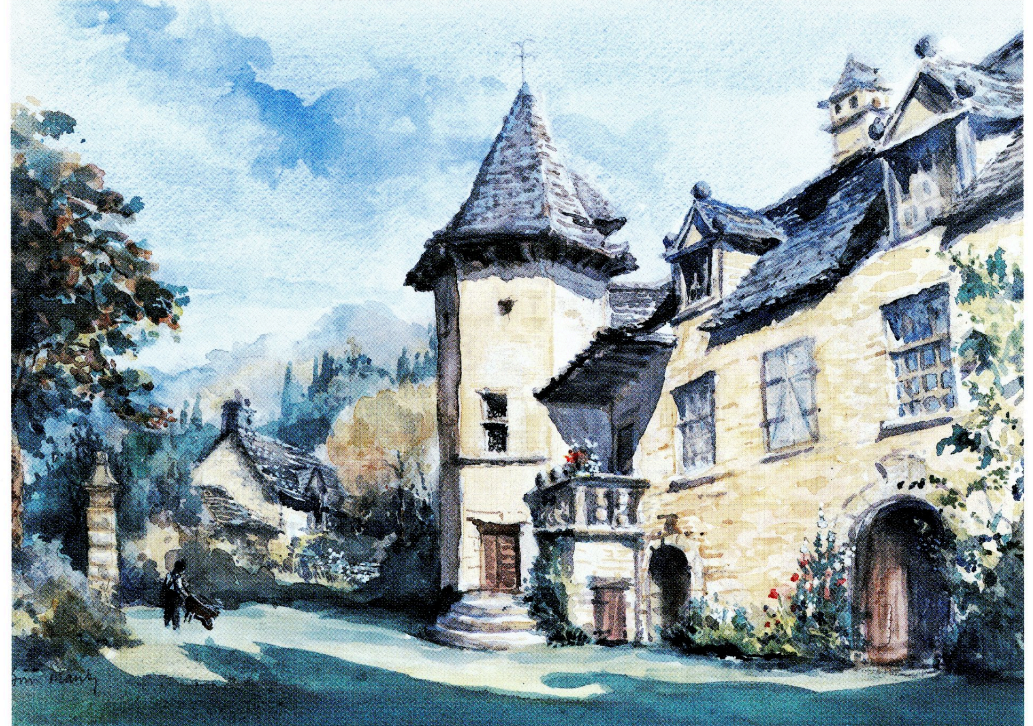
Ann Manly St Crepin-en-Carlucet, France 13" x 19 1/2"