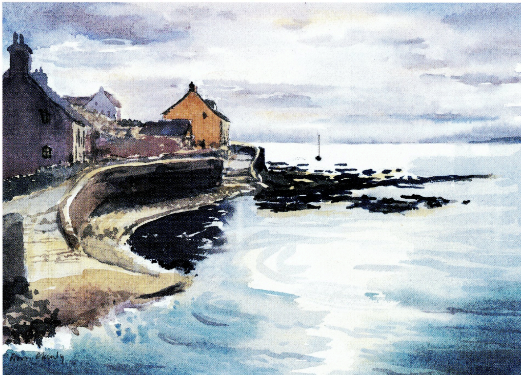
Ann Manly The Parog, Newport, Pems 10" x 13 1/2"