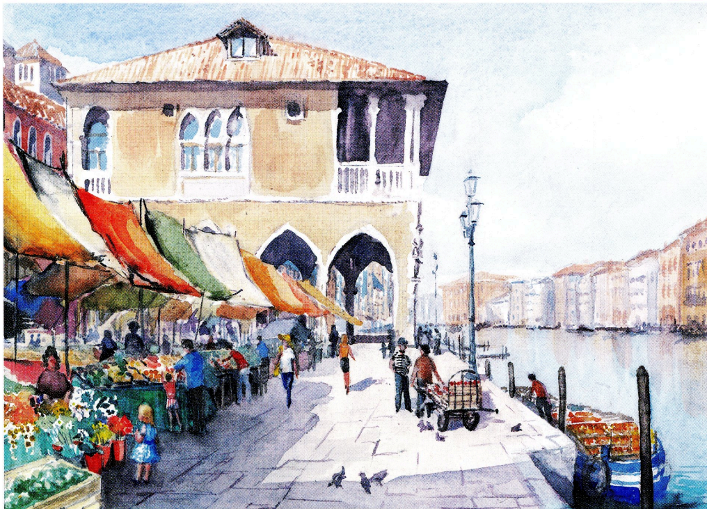
Ann Manly Market by the Pescheria, Venice 11" x 16 1/2"