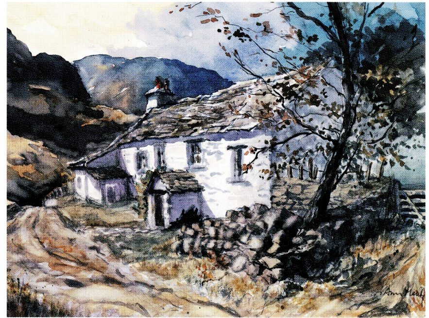
Ann Manly Cottage in St. John's Vale, Cumbria 9" x 13"