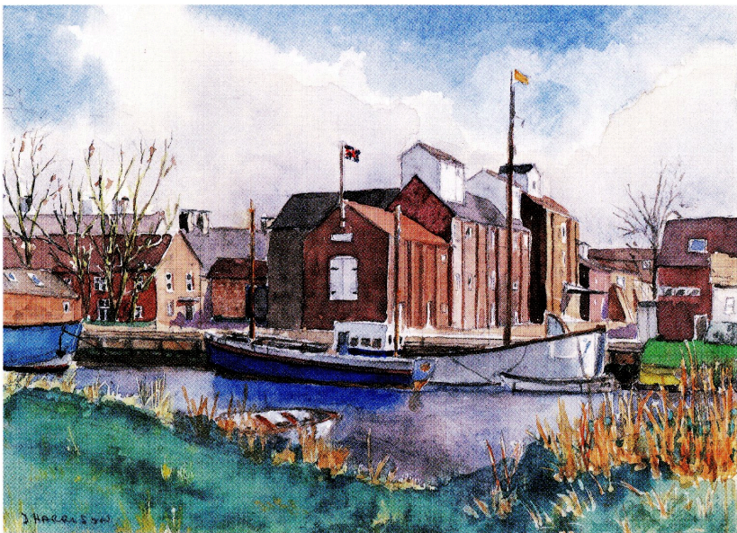
Dennis Harrison Shipping at Snape Quay, Suffolk 8" x 10"